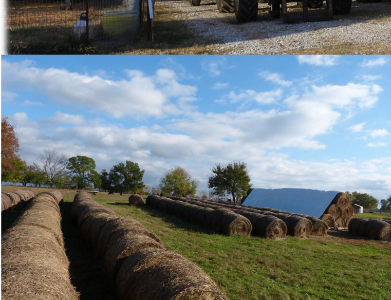
Multiple cuttings of hay yearly, utilizing natural rainfall.