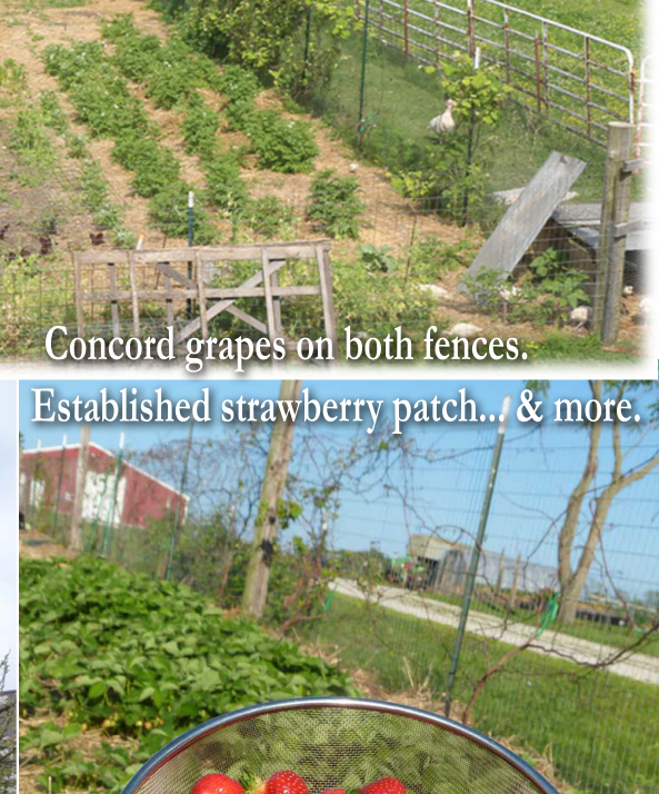
Concord grapes on both fences. Established strawberry patch... & more.