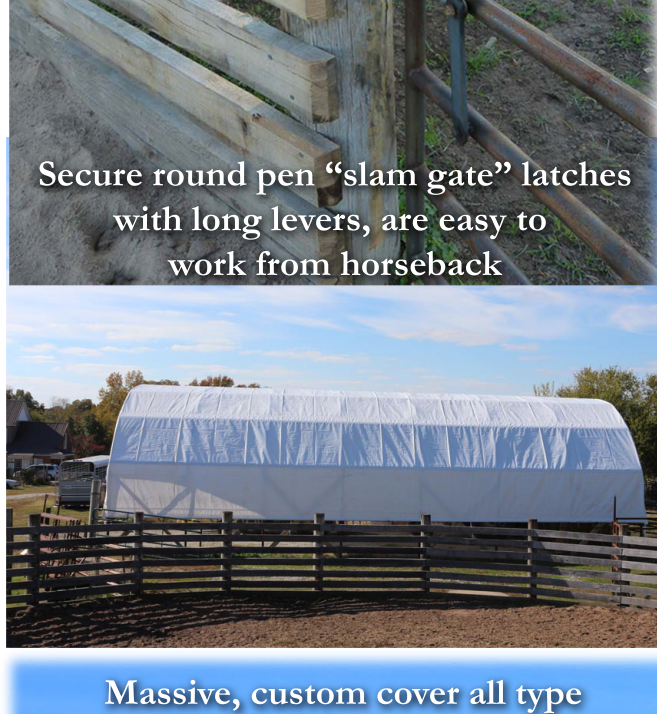
Secure round pen "slam gate" latches with long levers, are easy to work from horseback