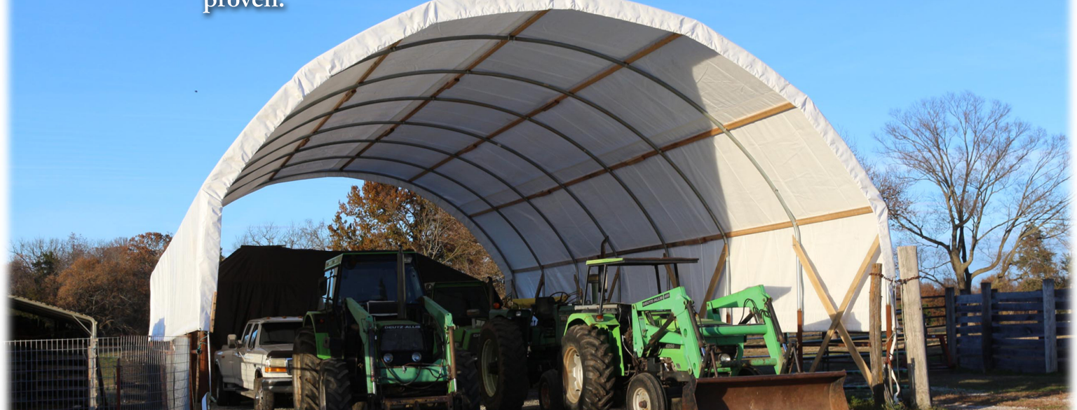
Massive, custom cover all type arch building for Hay/machine storage. Has withstood severe wind storms, proven.