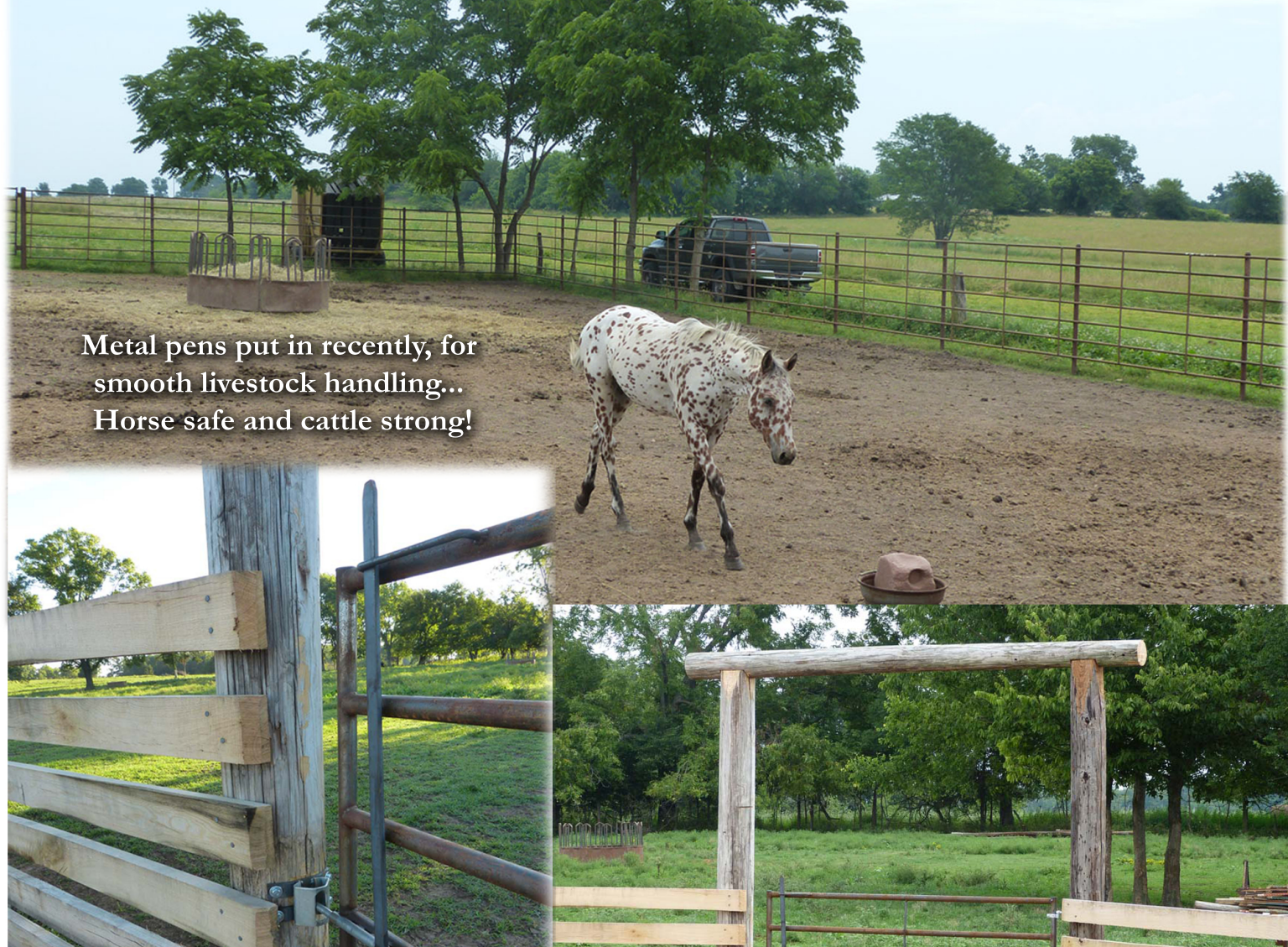
Metal pens put in recently, for smooth livestock handling... Horse safe and cattle strong!