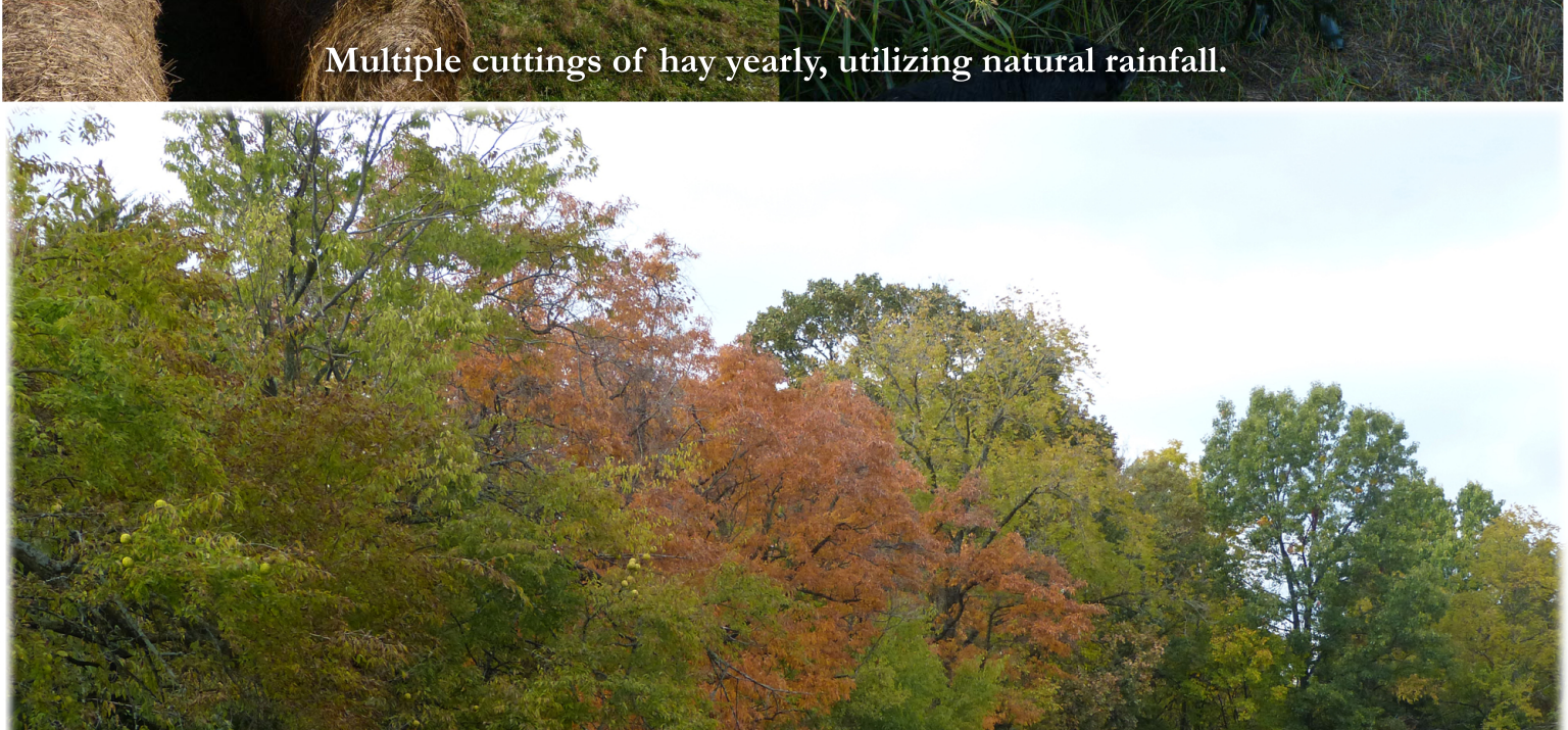
View of north pasture. Cleanly maintained, with some woods for max winter protection.