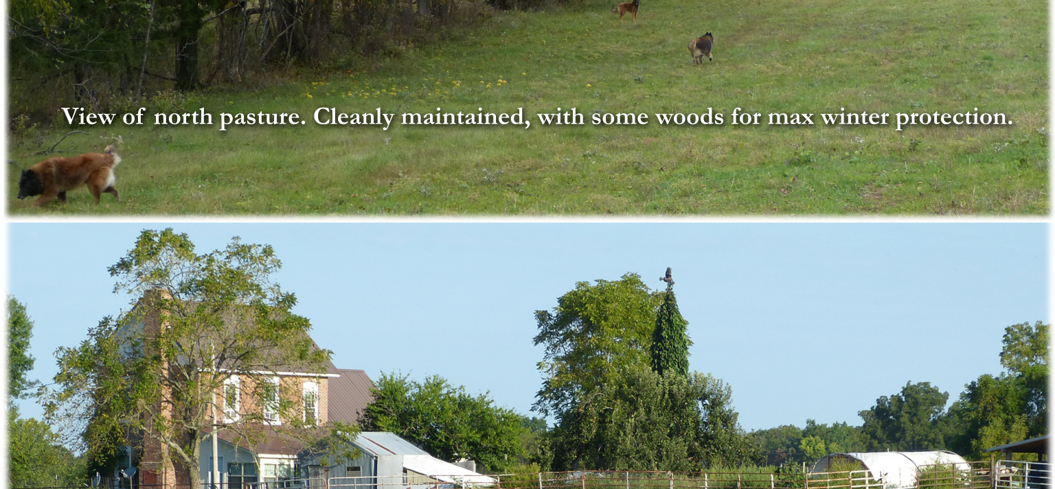
View from south pasture, of house and outbuilding, heritage apple tree, and south garden area.