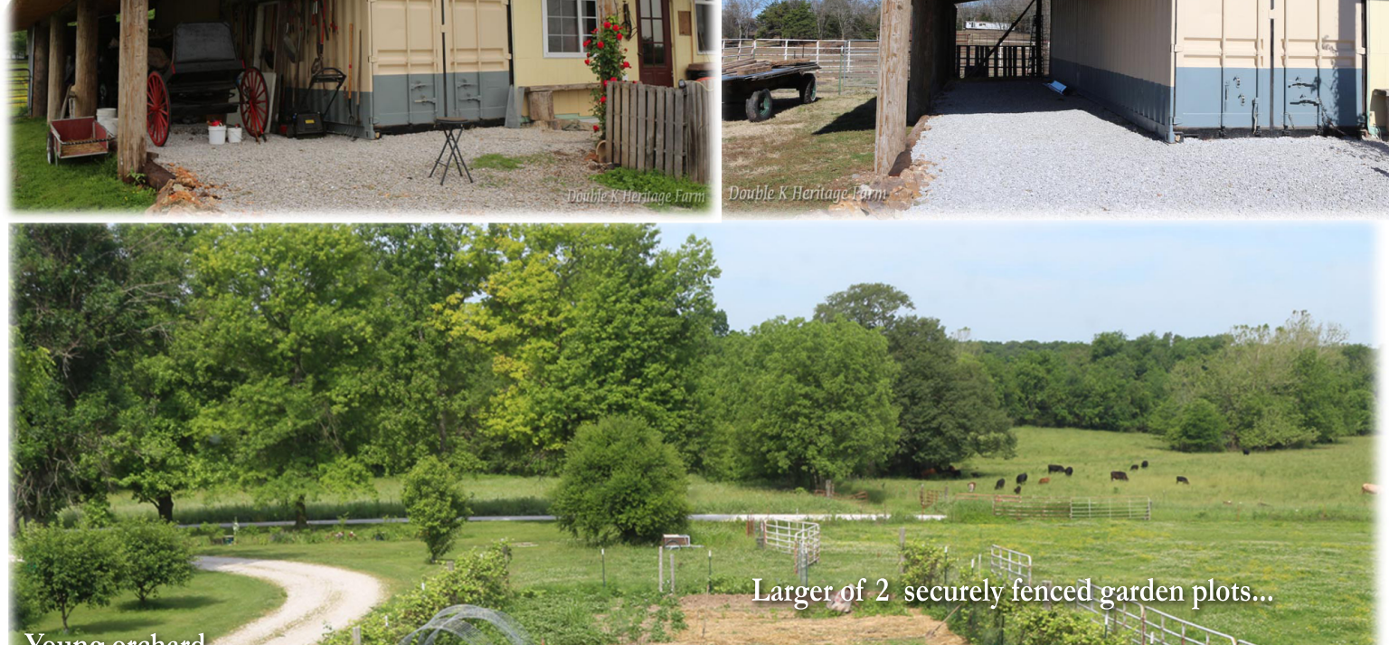
Young orchard growing near brick house...