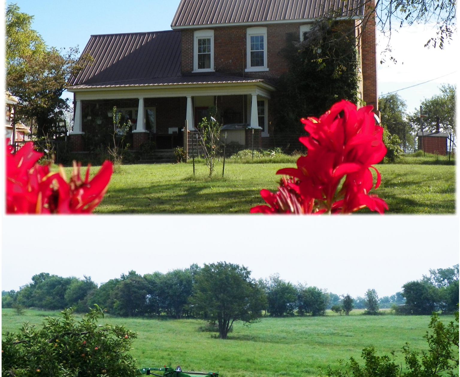
Looking east across the pastures, from the brick house window.