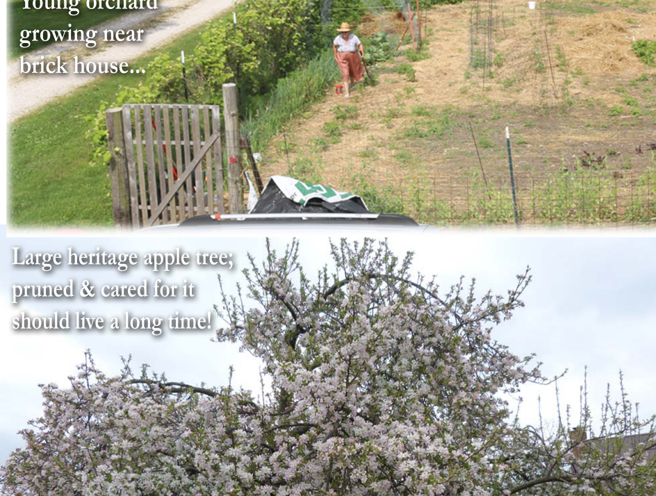
Large heritage apple tree; pruned & cared for it should live a long time!