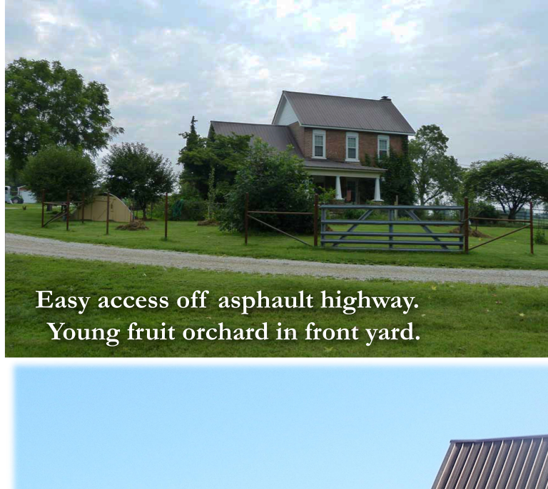
Easy access off asphalt highway. Young fruit orchard in front yard.