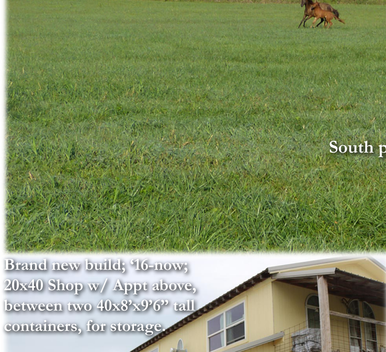
Brand new build; 16' now; 20x40 Shop w/ Appt above; between two 40x8'x9'6" tall containers, for storage.