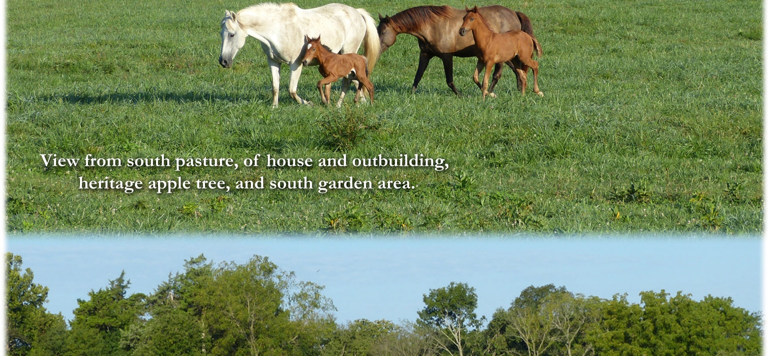
South pasture along approach to headquarters.