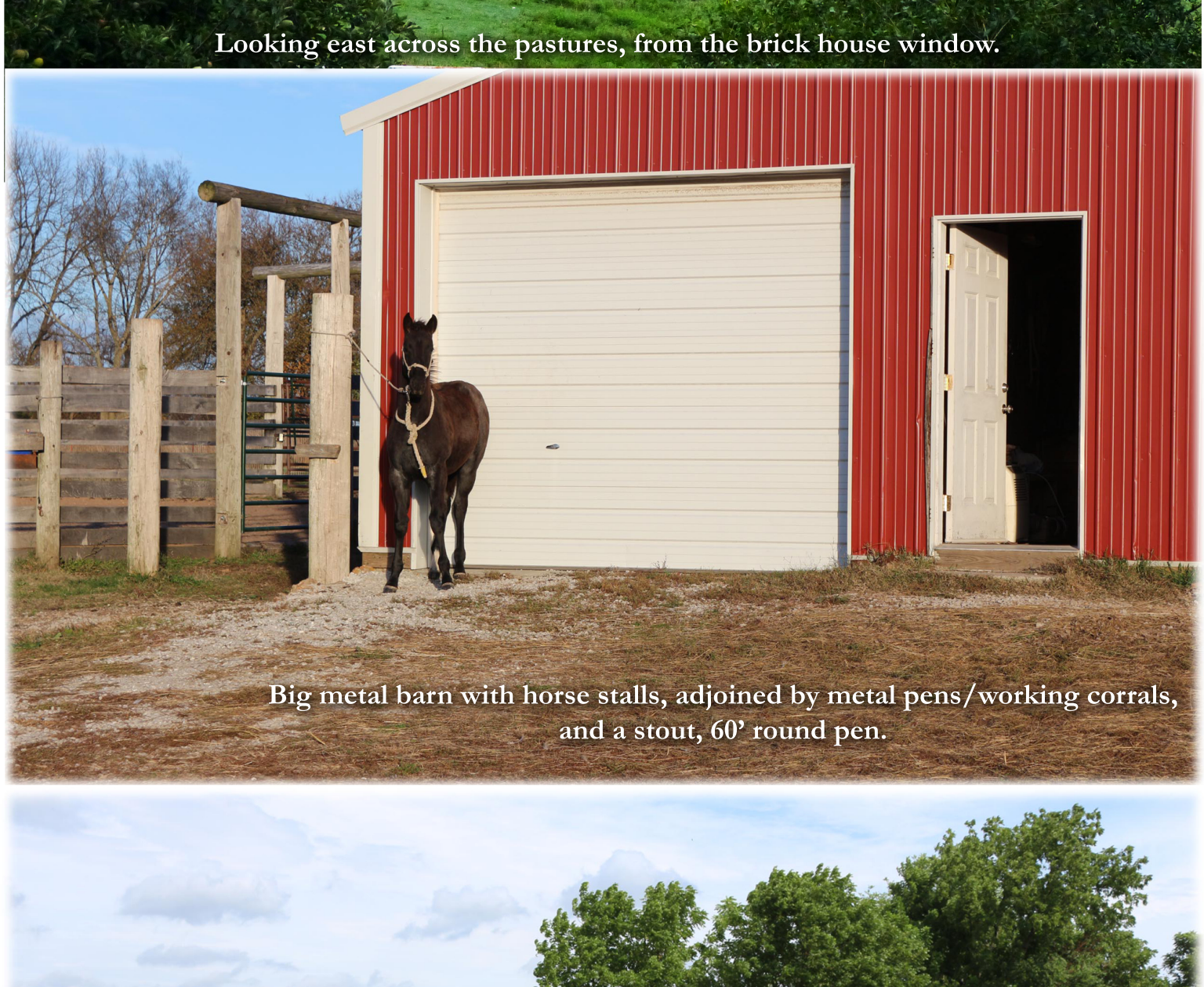
Big metal barn with horse stalls, adjoined by metal pens/working corrals, and a stout, 60' round pen.