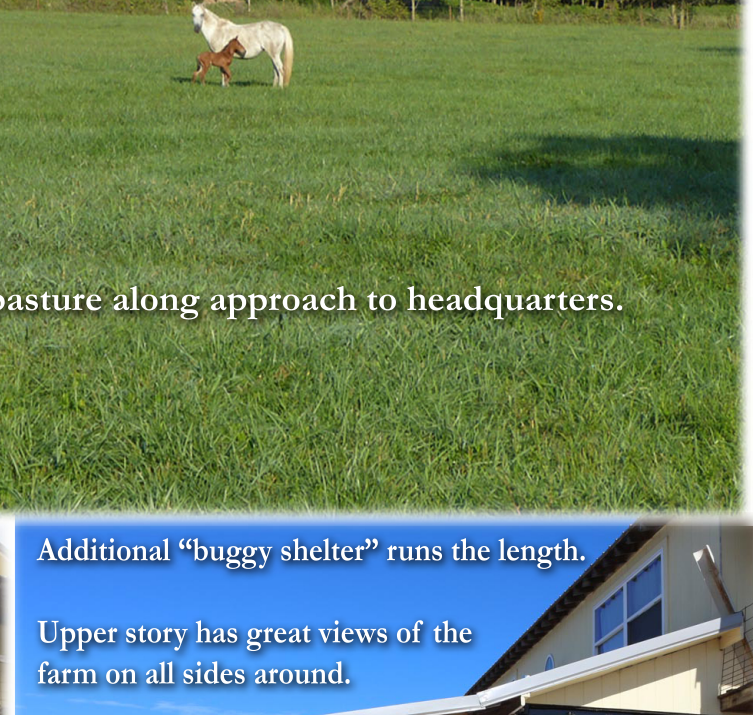
Additional "buggy shelter" runs the length. Upper story has great views of the farm on all sides around.