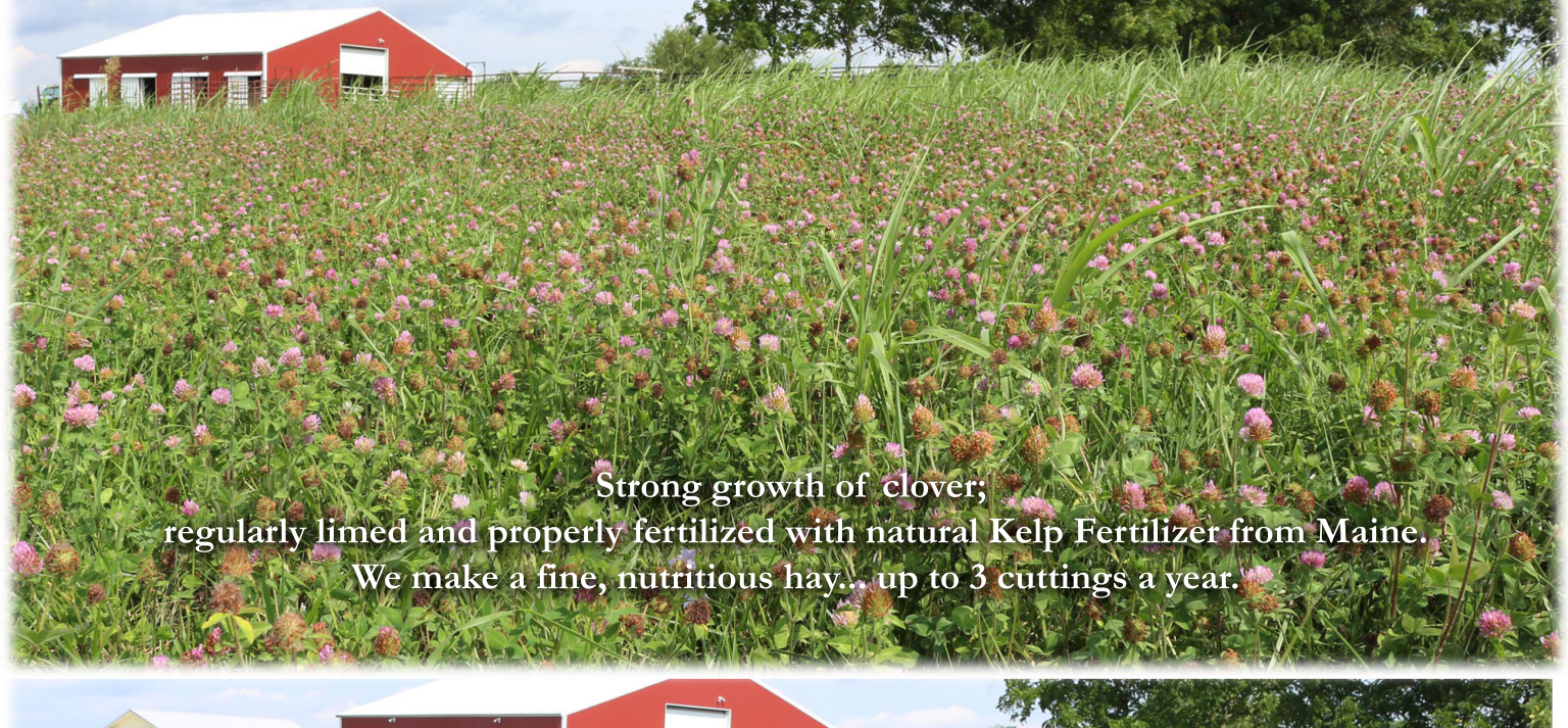
Strong growth of clover, regularly limed and properly fertilized with natural Kelp Fertilizer from Maine. We make a fine, nutritious hay... up to 3 cuttings a year.